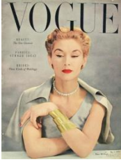
Vogue in 1970